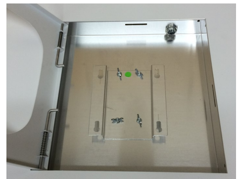
Integrated Mounting Plate, Cord Grip and Repositionable Door